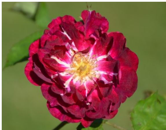
This newly opened bloom of ‘Geisha’ represents the deep red color of many of Geschwind’s roses.

Thus far in this newsletter we have looked at the famous rambler hybridizers from the mid to later rambler era. This month we will look at one of the true pioneers of rose hybridization, a man that challenged the popular theory of his time that to create a great rose you crossed two of the most beautiful roses to get a better rose. Geschwind reasoned that even good roses were as likely to transfer their bad traits and that the odds were that you would get a less vigorous prodigy, inferior to the two parents.