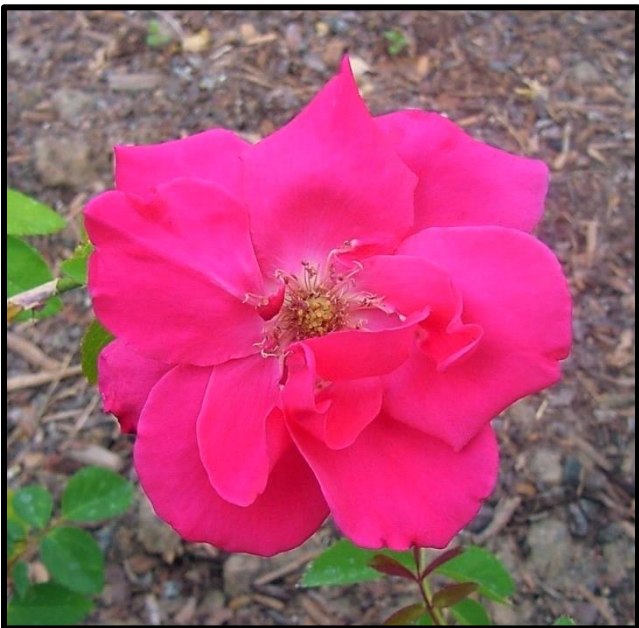
'Piccolo Pete'

'Butterfly Magic' is salmon-pink with a distinct yellow center. It has ten or so petals and its blooms are often four inches in diameter. 'Cinderella's Song' has beautiful blooms on a plant that has not handled disease pressure well here. The blooms are large, with seven to ten petals with pink edges surrounding a creamy yellow-white center. Resembling a little bonfire, a vivid red halo surrounds the base of the stamens and pistils. Although its parentage was never released, 'Peace' was a rose used by Dr. Buck and perhaps figures in this variety's background. The third variety, 'Cinnamon Spice,' originally went by the study name 'Prairie Symphony.' It is a cross of 'Carefree Beauty' and the red and yellow McGredy Hybrid Tea 'Piccadilly.' Its petals are heavily stippled with red on a base of rose-red that lightens to rose-pink as