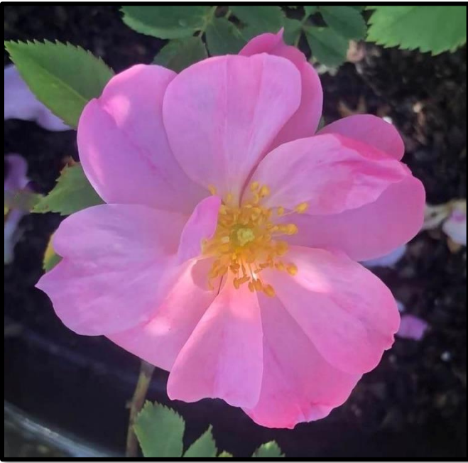
'Applejack'

Applejack is considered "America's Native Spirit." The Laird family began distilling it in 1678 in Monmouth, NJ. It was a drink popular with several US presidents including George Washington. Early nicknames for the spirit were: Jersey Lightning, Corpse Revivor, Essence of Lockjaw, and Horn of Gunpowder!