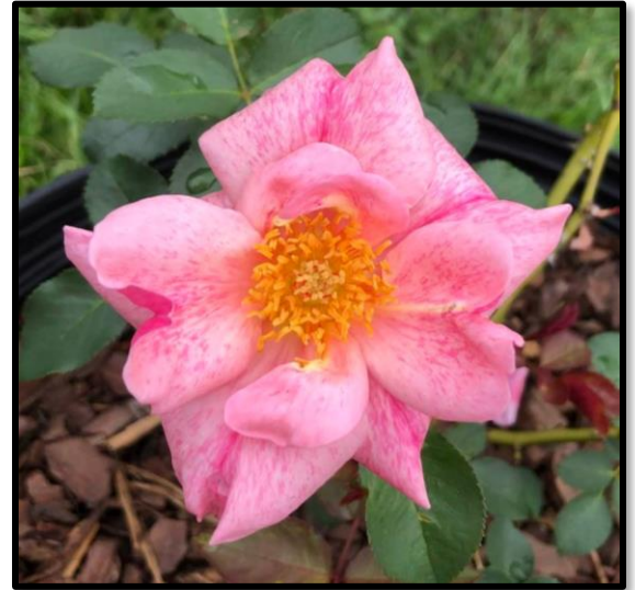
Right: 'Sevilliana'

In 1976, 'Sevilliana' was one of two sister seedlings released having relatively complex parentages. Its semi-double flowers are a soft flamingo pink with rose-red stippling inherited from 'Applejack' and a light fragrance. Dr. Buck used it to create several more varieties with pronounced stippling: 'Gee Whiz,' 'Incredible,' 'Spanish Rhapsody, and 'Mountain Music.' Its name was chosen to celebrate the energetic, flamenco style of music and dancing of the Spanish city of Seville. Without black spot prevention this variety has struggled in my garden.