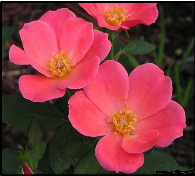
‘Summer Wind’

Lastly, is ‘Maytime.’ This single-flowered rose resulted from a cross of the yellow Brownell climber ‘Elegance’ and the vigorous pink ‘Prairie Princess,’ a Buck rose released in the late 60’s. The blooms of ‘Maytime’ are various shades of pink with a pale yellow center giving the overall impression of apricot. It was reported by California rose breeder Dr. Walter Lammerts to be immune to powdery mildew. The rose I have in my garden labeled ‘Maytime’ does not appear to match the color description and raises concerns that what is in commerce at present may be mislabeled. The cultivar that I have (see below) produced a red-flowered sport in 1982 (in the gardens of Roses Unlimited) that was registered and named ‘Brave Patriot.’