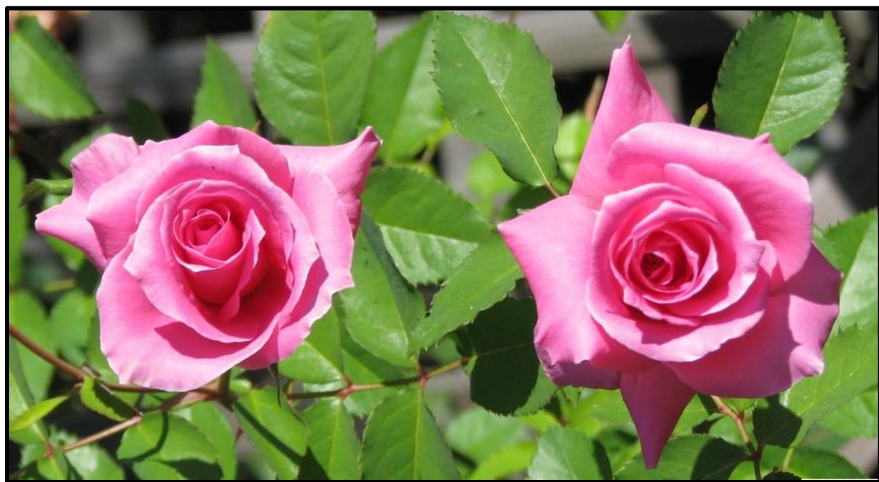
'Naga Belle'

An outstanding variety out of 'Carefree Beauty' bred by Viru Viraraghavan