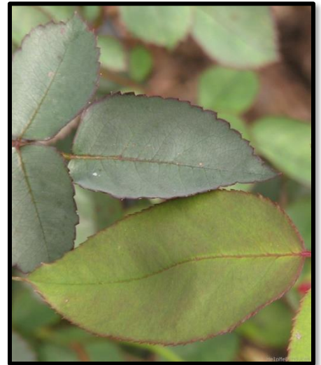
f1 ‘Prairie Flower’ foliage on top

‘Summer Wind,’ has ‘Applejack’ as a pollen parent and has inherited several of its traits - fragrance and black spot tolerance. Foliage fragrance has been noted by some under the right conditions. Its blooms have roughly seven to twelve petals that vary in color depending on climate. Dr. Buck described it as a shade of orange-red fading to a salmony shade of pink. In my garden the latter color is the norm. A study conducted in north-central Texas found that ‘Summer Wind’ was never infected with powdery mildew during a recent four-year trial ( Landscape Performance of Buck Roses Under Minimal-input Conditions in North-Central Texas , https://digitalcommons.tamuc.edu/cgi/viewcontent.cgi?article=1001&context=ag-science-faculty-publications ). ‘Summer Wind’ has been used by a Florida friend to create several very appealing, registered hybrids (see photos at end of article).