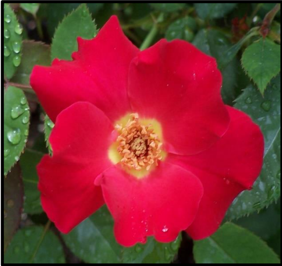
Left: 'Brave Patriot'