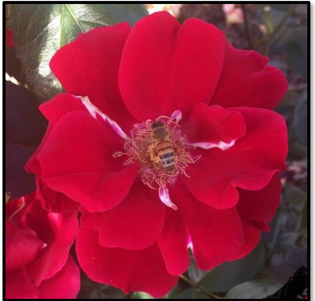
'Prairie Clogger'