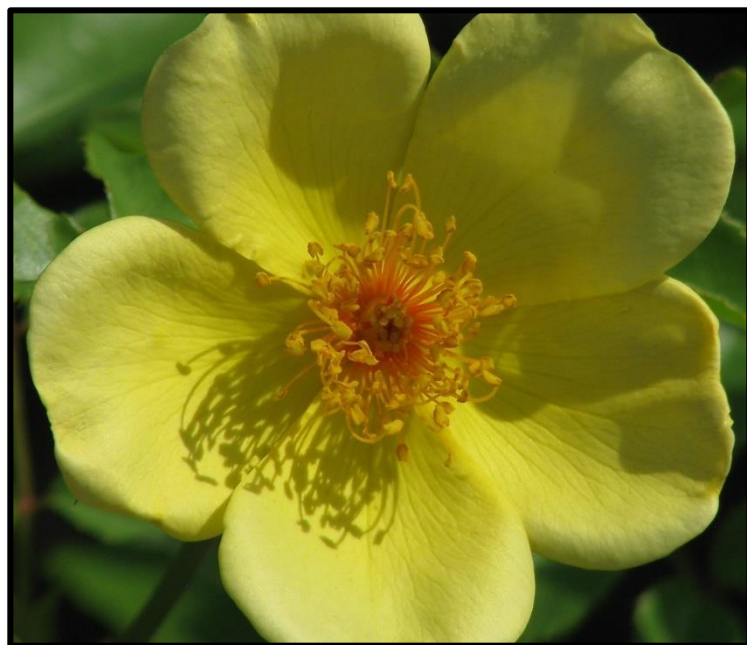
Upper Right: 'Tottering-By-Gently'