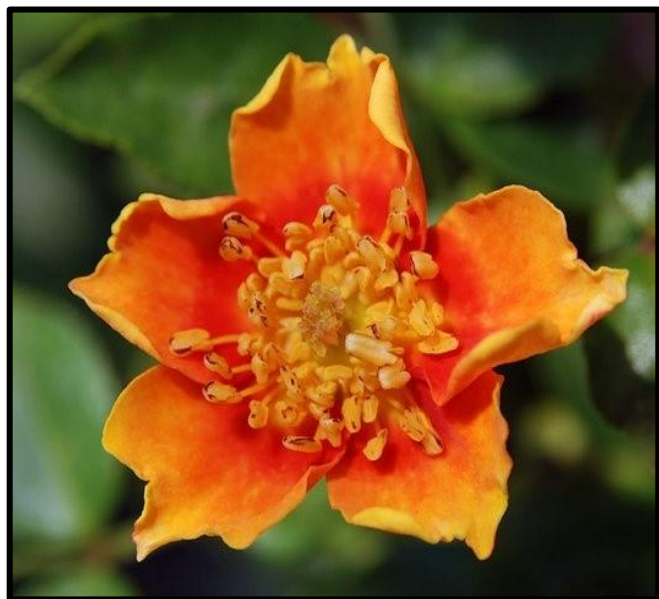
Lower Left: ‘Halo Gold’