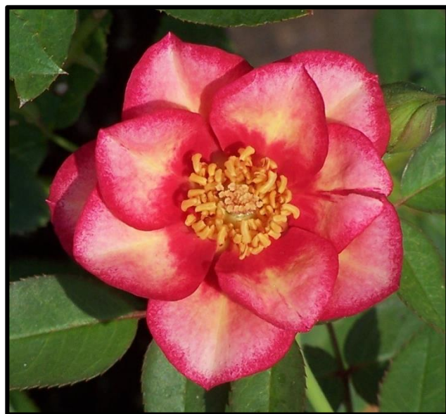
Upper Right: ‘Halo Sweetie’

The last in the series, ‘Halo Gold,’ arrived in 2004. The 2007 Sequoia catalog described it as having “a halo with orange, gold, and russet colors changing to pink on wavy scalloped petals. 1” flowers on this compact plant are very good for pressing.” Only one photo of it appears to have ever been published.