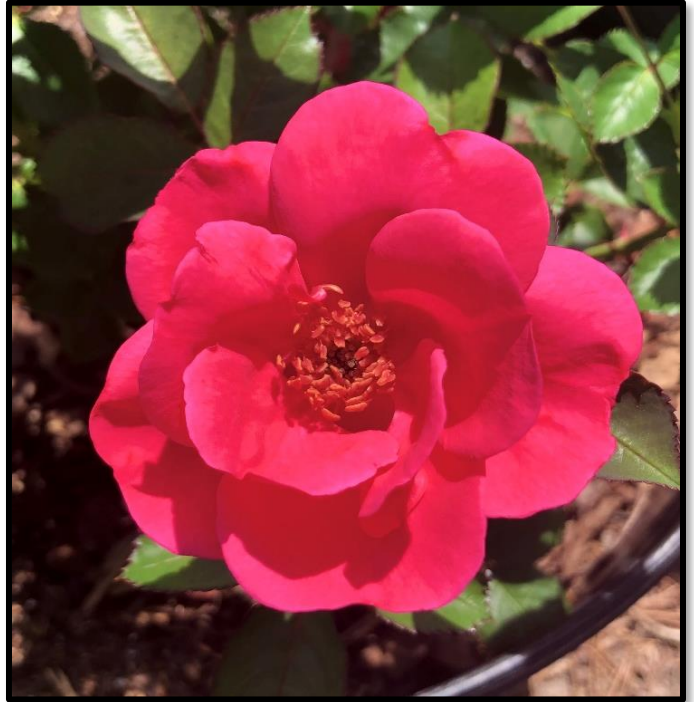
'Pink Miracle'

In 2021 two new roses, 'Pink Miracle' and 'Coral Miracle,' were released by Certified Roses. 'Pink Miracle' is a ten petaled hot pink cultivar. The filaments arise from a dark red base, a feature that I find quite appealing. Several characteristics distinguish it from other single-flowered pink floribundas and shrubs - no fade and no white eye. In its first year in my garden the blooms generally arrived one per stem and had a slightly more upright habit of growth than 'Coral Miracle' or 'Miracle On The Hudson.' The dark green semi-glossy foliage is very black spot resistant; maroon tinted new growth provides an attractive foil to the neon colored blooms.