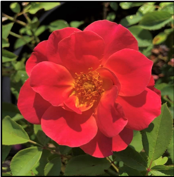
'Coral Miracle'

'Coral Miracle's petals are a uniquely colored pastel coral-orange on the surface contrasted by a lighter reverse. Golden yellow stamens brighten the blooms up even further. Most blooms generally have at least fifteen petals and arrive both one-per-stem and in small clusters. One reviewer states that it has a more pronounced fragrance than the other "Miracles," although that feature has escaped my notice. The matt foliage is olive green and has been quite black spot resistant in my long Georgia growing season. 'Coral Miracle' has a bushy habit, much like 'Miracle On The Hudson.'