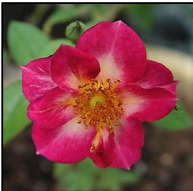
Left: 'Halo Rainbow'