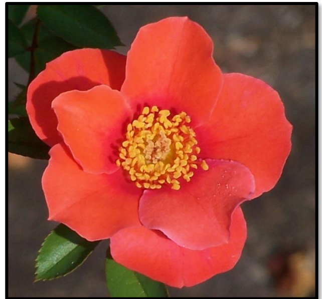
Above: 'Halo Today'

In 1994 the catalog featured two new introductions. 'Halo Today' resulted from a cross of 'Peach Halo' x ('Anytime' x 'Lavender Jewel'). Its petal count varied from five to twelve and its base color was a sort of Fanta Orange (the soft drink!). The halo was a rather subtle purplish red, perhaps taking a back seat to the vibrant yellow stamens. A cross of 'Peach Halo' with 'Make Believe' (another seedling out of 'Anytime' x 'Angel Face'), yielded 'Halo Rainbow.' Its petals were white, edged with a band of pink and a conspicuous rose-red halo. Despite its dramatic color the variety did not appear in Sequoia catalogs again except in their limited numbers supplemental lists. Curiously though, Ralph would use it as a pollen parent for future introductions.