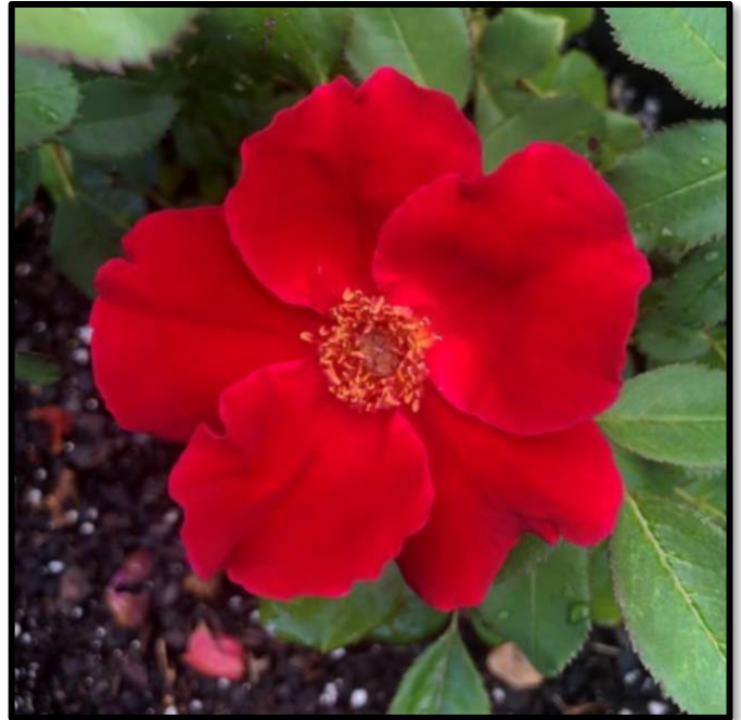
'Miracle On The Hudson'

'Miracle on the Hudson' is an example of another of his breeding goals – strong resistance to fungus diseases like black spot, powdery mildew, and rust. It resulted from a cross of 'Lyn Griffith' (a very clean semi-double seedling from Robert's breeding program) x 'Home Run.' Its five to eight petals are fluorescent crimson red with darker accents, a color spectacularly accented by glowing golden yellow stamens. Blooms arrive singularly and in small clusters. The foliage is dark green with burgundy margins and has been immune to black spot in my Georgia garden. Its resistance to powdery mildew and rust has been confirmed by California growers as well. Robert tentatively named the rose "Bartholomew" in honor of the appointment of Bartholomew I as archbishop of the Eastern Orthodox church in 2009. Robert sent this seedling to Pat Henry and Bill Patterson of Roses Unlimited. Pat thought so highly of the velvety, bright red flowers that appeared on the new plant that she suggested the name 'Miracle On The Hudson' to honor the miraculous survival of all the passengers of US Airways Flight 1549 after Captain "Sully" Sullenberger successfully landed the plane on the Hudson River on January 15, 2009.