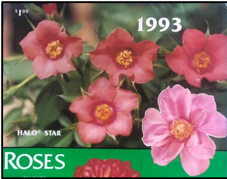
'Halo Star' - top row and center